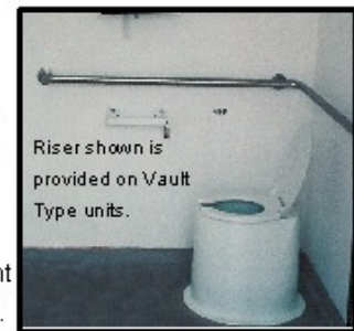
Riser shown is provided on Vault Type units.

Vent pipes allow free air flow from both vaults and prevent cross venting. Smell goes through the vent pipe and not in the building.