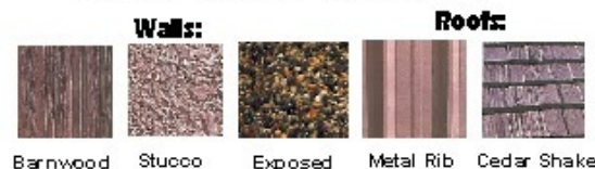
Barnwood Stucco Exposed Metal Rib Cedar Shake