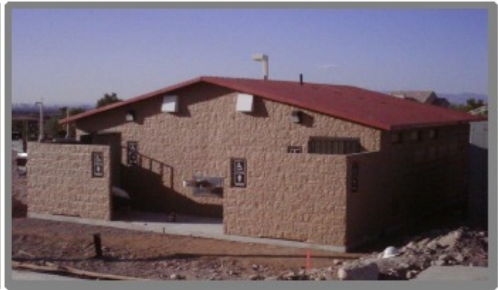
FRESNO MODELS ABOVE: Split-face block exterior with simulated ribbed metal roof Optional Textures and Colors are available.

FRESNO MODEL PROVIDES YEARS OF LOW MAINTENANCE SERVICE. INSTALLATION TAKES JUST ONE DAY. CALL FOR MORE DETAILED DRAWINGS & SPECIFICATIONS.