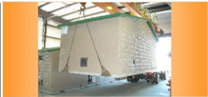
Manufactured in a controlled and safe environment.